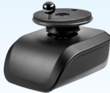
Mini steering wheel

How does your car know what to do? With our sophisticated input devices, operation is very easy regardless of your disability.